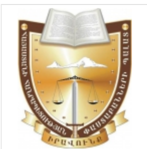
22.12.2015 TRAINING ON THE THEME 'EXAMINATION ORDER