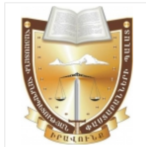
18.11.2015 TRAINING ON THE THEME 'THE TYPES ADMINISTRATIVE ACTS: ANNULMENT OF ADMINISTRATIVE ACTS.'