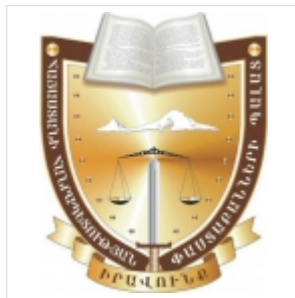
18.09.2015 TRAINING ON THE THEME 'MANAGEMENT OF EMOTIONS IN THE PROFESSIONAL ACTIVITY'